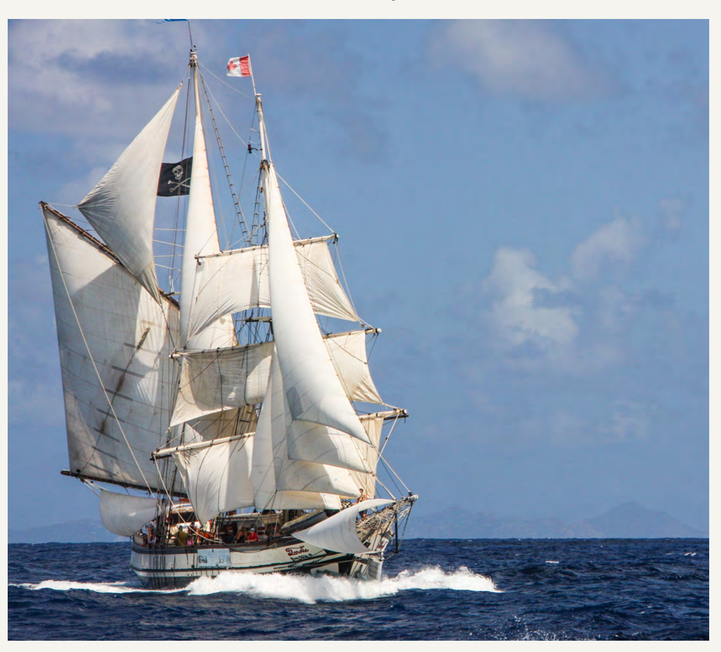
YOUR SAILING ADVENTURE